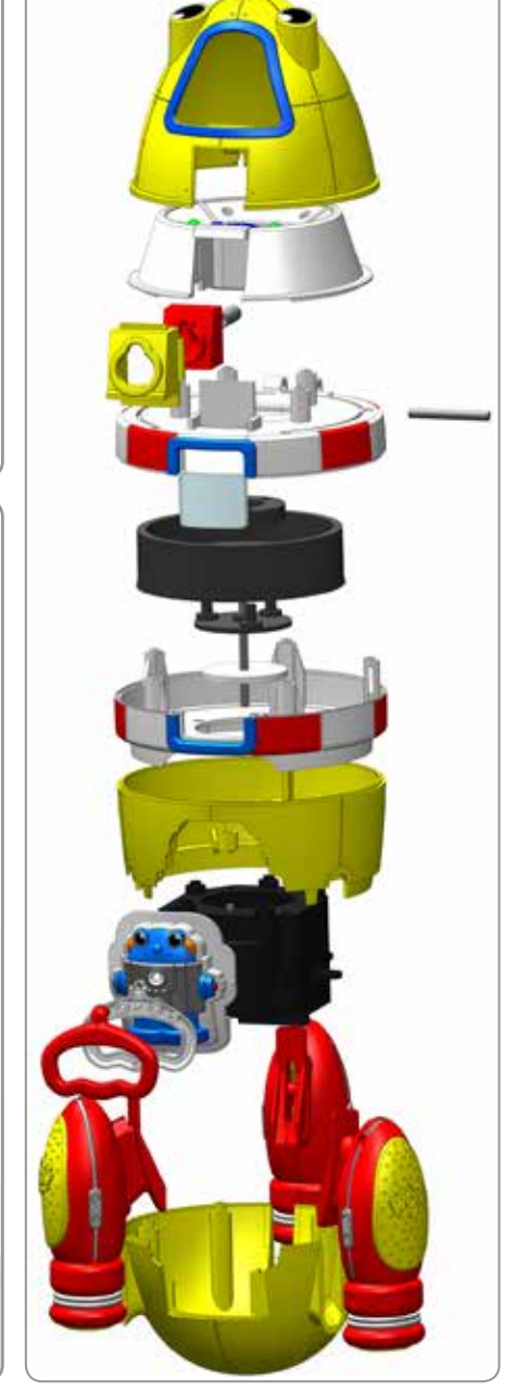
Full portfolio available at chriscatton.com